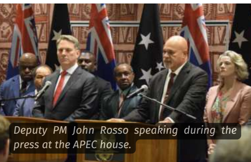
Deputy PM John Rosso speaking during the press at the APEC house.

While addressing the press, Deputy Prime Minister John Rosso said; "on behalf of my Prime Minister, our Government, my colleagues, I'd like to appreciate and say a warm thank you to you and the two co-chairs on both sides, Minister Wong and Minister Tkatchenko, on successfully co-hosting a very successful Ministerial Forum."