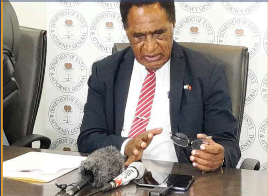
DJAG Media Team Undergo First Drone Pilot Training