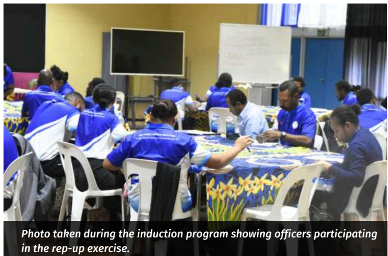
Photo taken during the induction program showing officers participating in the rep-up exercise.