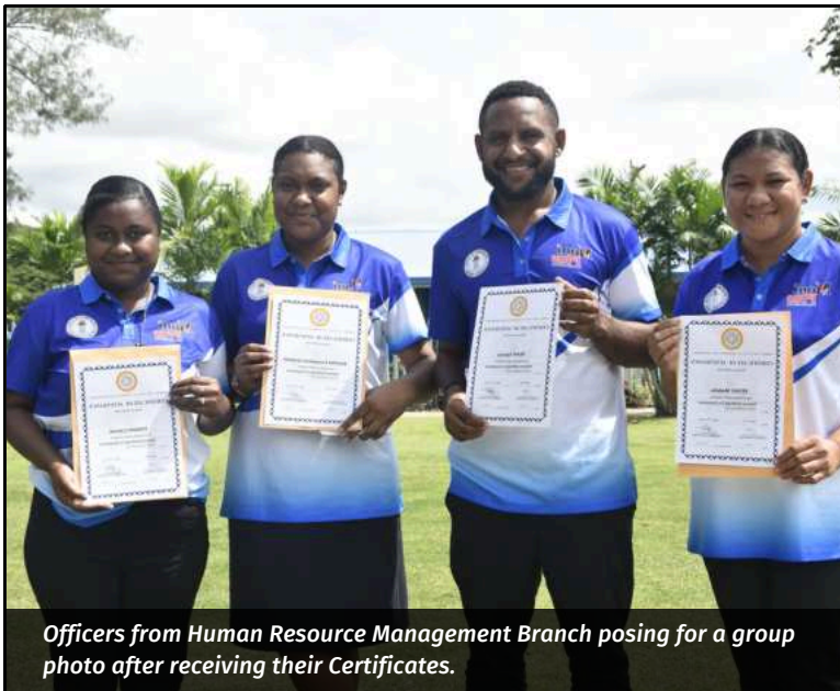
Officers from Human Resource Management Branch posing for a group photo after receiving their Certificates.