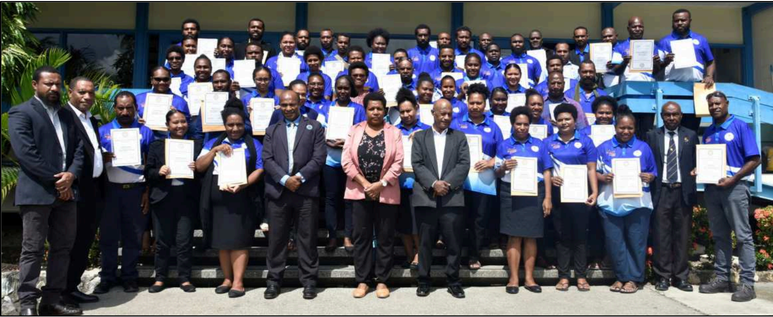
Picture: Graduates from the Induction Training posing with their certificates. Also posing are DJAG managerial team and facilitators of the training.

More than 50 officers from the Department of Justice and Attorney General (DJAG) recently graduated from the Public Service Induction Training on the 17th of May at the Somare Institute of Leadership and Governance (SILAG) in Port Moresby.