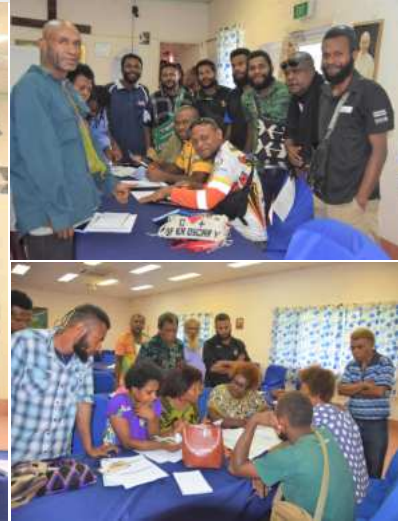
ABOVE Left: Participants of the training posing for a group photo after Training Day no. 4, Vunapope Catholic Archdiocese, Kokopo, ENB Province. ABOVE Right: Participants doing group exercise on the new Case Management System on Training Day No. 5 at the Vunapope Catholic Archdiocese.

More than 50 Village Courts officials have successfully completed a weeklong training on the newly established Case Management System at the Vunapope Catholic Archdiocese in Kokopo, East New Britain Province from the 24th- 28th June, 2024.