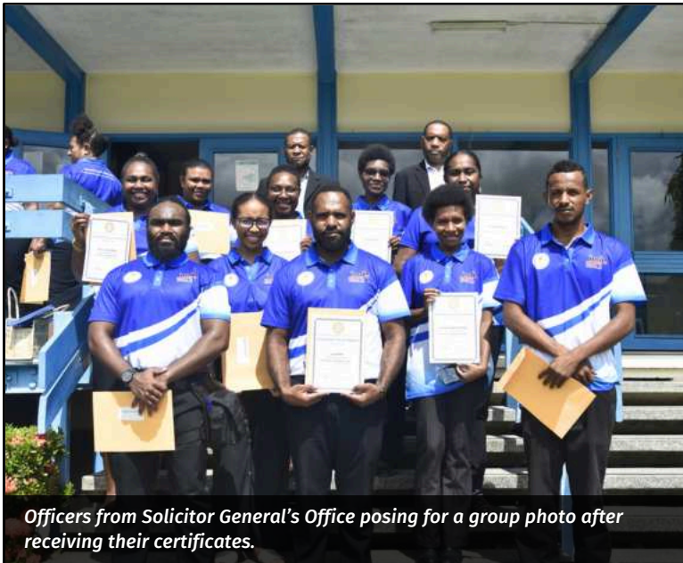
Officers from Solicitor General's Office posing for a group photo after receiving their certificates.

Officers graduated from the Public Service Induction program at the Somare Institute of Leadership & Governance.