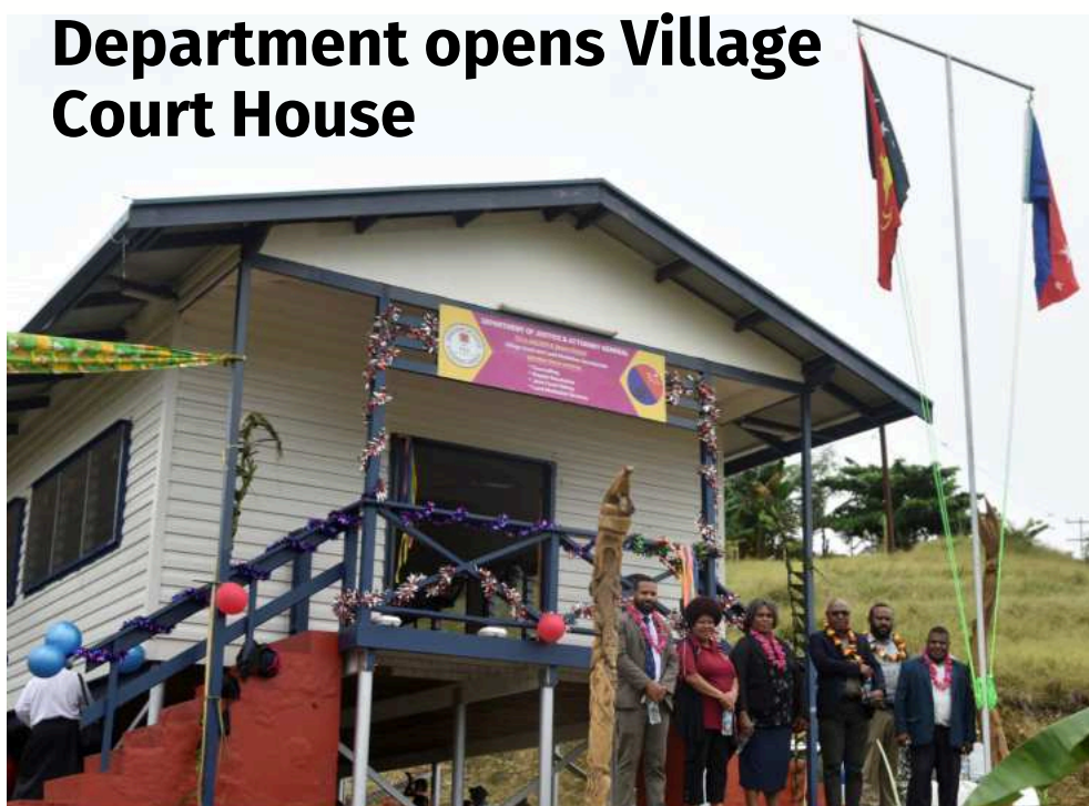
Picture: DJAG officers posing for group photo after the official opening of the Tubusereia Village Court house in Central Province.