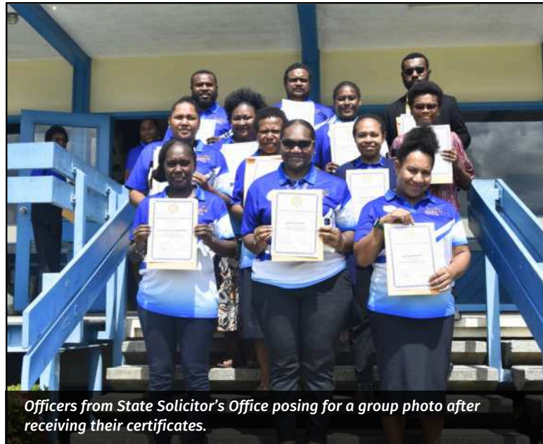
Officers from State Solicitor's Office posing for a group photo after receiving their certificates.