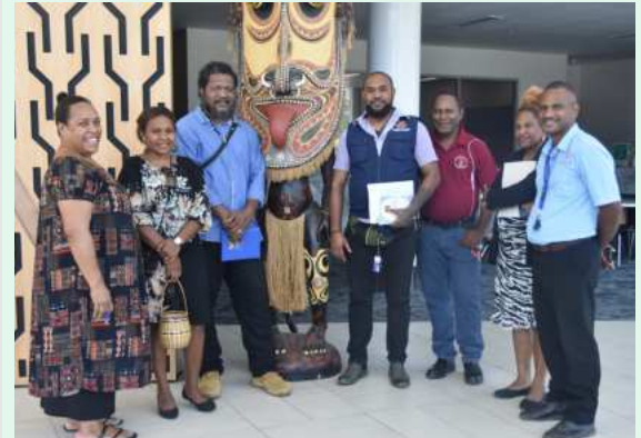
Picture: DJAG Logistic Team starts preparation for PILON 2025 at the APEC Haus in Port Moresby.

The Department of Justice & Attorney General (DJAG) as the lead agency in the Law and Justice Sector is undergoing preparation to host the PILON in 2025.