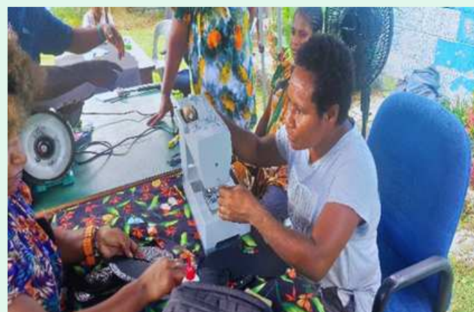
Picture: Participants showing life skill practices during the training.

A total of 11 participants (Juveniles, Parolees and Probationers respectively) underwent a week-long training on Upholstery and basic leather making at the Hohola Remand Center in Port Moresby.