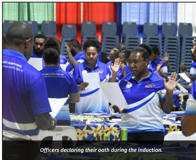
Officers declaring their oath during the induction.