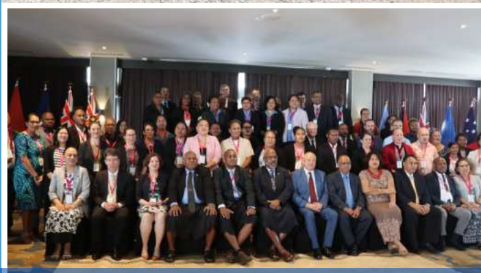
PILON Annual Meeting, Fiji, 29/10/2024