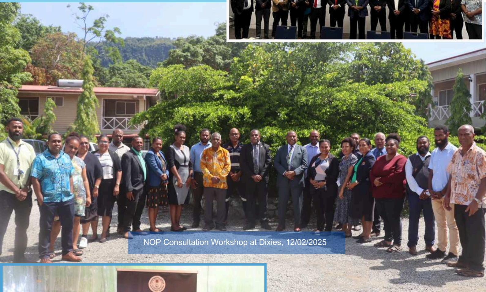
NOP Consultation Workshop at Dixies, 12/02/2025