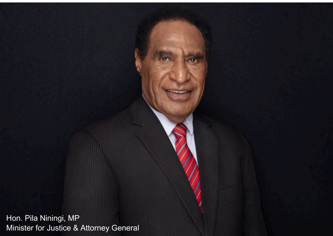
Hon. Pila Niningi, MP Minister for Justice & Attorney General