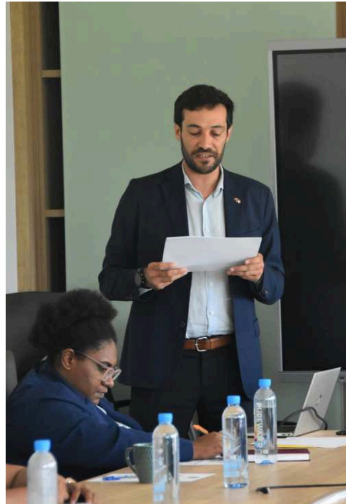
Mr. Clement Brousse, the Counsellor for Global Issues, France Embassy, Papua New Guinea, addressing DJAG and Oceans Affairs staff, and staff from the stakeholder agencies in conference for the upcoming UNOC3 in France.

By participating in high-level discussions, PNG will strengthen international cooperation, advocate for sustainable ocean policies, and ensure its voice is heard on a global platform.