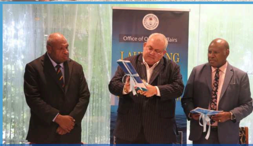
Launching of Revised MSR Guidelines, Airways, 06/02/2025