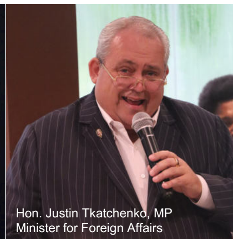
Hon. Justin Tkatchenko, MP Minister for Foreign Affairs