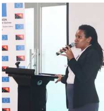
Speaking during the closing of the training last year. Below: Getting ready to start another busy day.

"For instance, junior employees might hesitate to report incidents of discrimination due to concerns about possible repercussions. Another obstacle is the resistance to change, particularly when established practices are altered. For example, a younger leader may find it difficult to earn the acceptance of older colleagues, as cultural norms often associate leadership with age. Furthermore, managing the diverse viewpoints of individuals from different cultural backgrounds poses yet another challenge," she said.