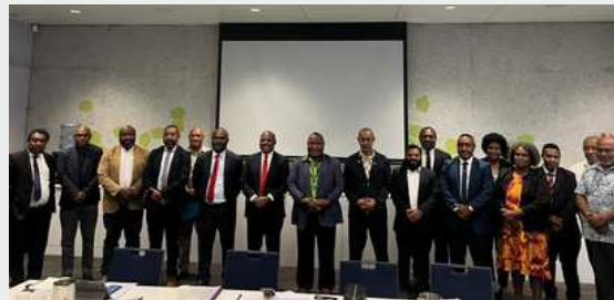
Prime Minister Hon. James Marape (centre) and other key government agency leaders participated during the briefing at the Hilton Hotel in Port Moresby.

The Department successfully participated in a high-level meeting alongside key government law and justice sector agencies to present its performance report to the Prime Minister, Hon. James Marape. This meeting held on Sunday 16/02/2025 at the Hilton Hotel, was convened at the direction of the Prime Minister, following a circular issued by the Department of Prime Minister & National Executive Council (PMNEC Circular No. 05/2025 ), urging all key government agencies to report on their achievements and priorities.